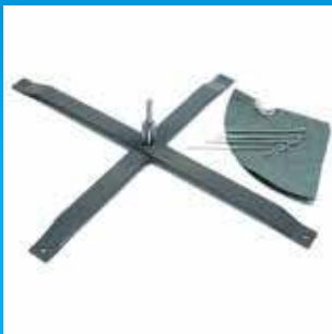
Universal Cross Base For use on hard ground, indoors or out, holes on the feet allow for pegging to soft ground. Powder coated steel and ball bearing spindle for smooth flag rotation. Measurements: Longest Arm 835mm x 50mm Shortest Arm 725mm x 50mm *water bag sold separately (£15 while stocks last)