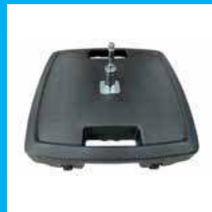
Concrete Base For use on hard ground, indoors or out. Ideal for forecourt displays or semi-permanent positions. Steel and ball bearing spindle for smooth flag rotation. Weight: 29kg