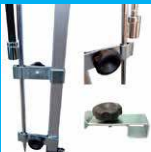
Feather Flag Mounting Clamps Mounting clamps are an ideal solution for attaching your feather flag to the frame of an XG event tent. Suitable for use on the 3x3M, 3x4.5M and 3x6M event tents. (Not suitable for 5.5M hexagonal event tents). 2 x clamps are required per flag and a rotating ground spike.