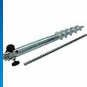
Snow/Beach/Sand Screw Ground Spike This plated steel rotating screw in stake is a hammer free way to support your flag on snow or sand ball bearing spindle for smooth flag rotation. Length: 380mm