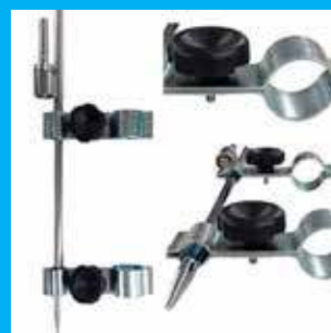
Feather Flag Mounting Clamps (Hexagonal Tent) XG hexagonal event tent clamps allow you to fix your feather flag to the frame of a 5.5M hexagonal event tent. 2 x clamps are required per flag and a rotating ground spike.