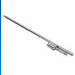
Rotating Ground Spike Chrome plated steel for soft ground. Ball bearing spindle for smooth flag rotation. Length: 500mm

Feather flags are easily set up in a couple of minutes and combined with the correct base choice, can be used on hard or soft ground.