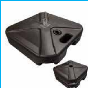
Water or Sand Filled Base For use on hard ground, indoors or out, pre-shaped grooves allow it to be used with our cross base or multiple bases for extra weight and stability if required. Steel and ball bearing spindle for smooth flag rotation. Measurements: 450x450x120mm Weight: 3kg empty, 15kg when filled with water.