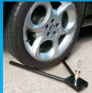
Rotating Wheel Base Black powder coated steel feet with chrome plated steel spindle. Simply wedge under a car wheel or drive onto base for maximum security. Folding design for ease of storage and transit.