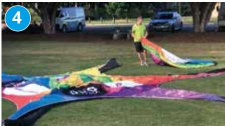
4 Inflatable Tent Accessories* Layout your walls and awnings and confirm positioning.