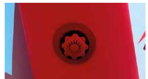
Over pressure relief valve system. DO NOT TOUCH.

When the tent is in use, do not leave your tent unattended.