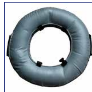
Sand Bags x 4.