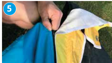
5 Attach the accessories using zips.