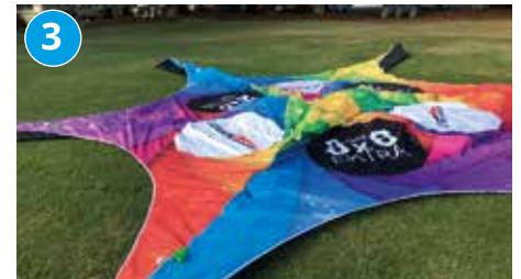
3 Lay the Inflatable Tent out flat.