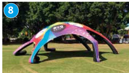
8 During the inflation process raise legs into the center until all legs are upright.