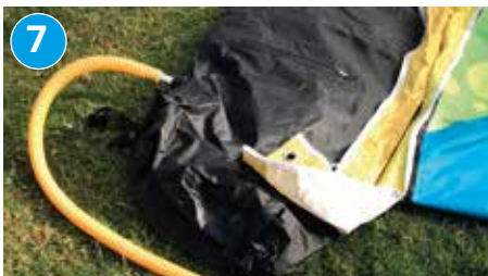
7 Connect the pump to selected inflation valve and begin inflation.