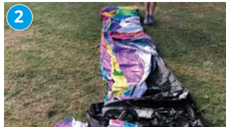
2 Roll out the Inflatable Tent.