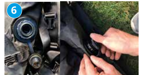
6 Each leg on the Inflatable Tent has a valve. Select valve to attach pump, screw inflation valve closed and leave cap off. On all other valves screw tight and fix cap.