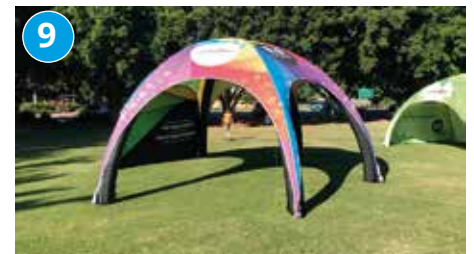
9 Ensure all legs are lined up and the Canopy is centered. Check frame is firm.