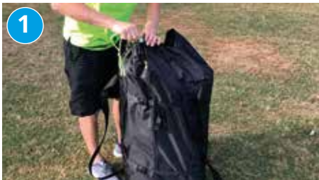
1 Remove the Inflatable Tent from the protective cover.

Recommended procedure below. For safety reasons it is recommended that 2 persons set up any inflatable tent. Ensure area is free from any sharp objects and overhead objects.