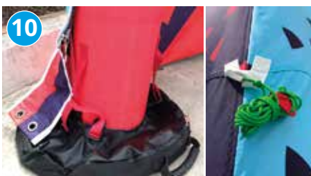
10 Fix stakes and guide ropes or attach sandbags.