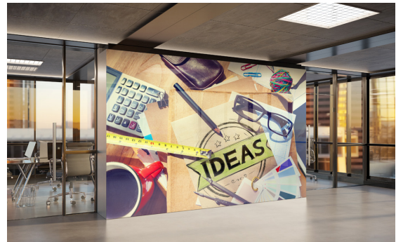
DECORTRACK - STRETCH FABRIC WALL TRACK SYSTEMS

Acoustic sound-absorbing felt, when integrated with either our Wall-Mounted Tension Fabric Wall Art Systems or DecorTrack, a Stretch Fabric Wall Track System, offers a versatile and functional solution for enhancing interior spaces' aesthetic and acoustic qualities. This 10mm felt, made from eco-friendly materials, effectively cuts down sound reflections and ambient noise, creating a quieter space. It improves acoustics in places like stores, offices, studios, and hotels.