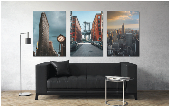
WALL-MOUNTED TENSION FABRIC WALL ART

We offer acoustic wall art solutions with two versatile options: wall-mounted tension fabric and our stretch fabric wall system, DecorTrack, designed to enhance sound quality while adding a stylish visual impact.