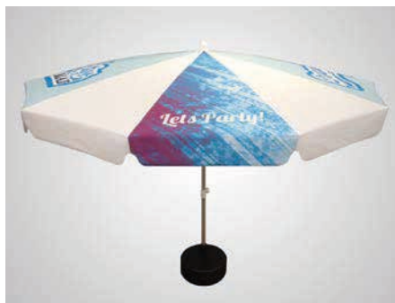
3 metre Round Parasol