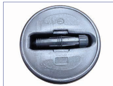
Parasol Base Kit