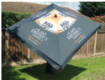
2 metre Square Parasol

2 metre square and 3 metre round parasols are for professional event use and we recommend guides should be followed to ensure your parasol always looks and performs at its best.