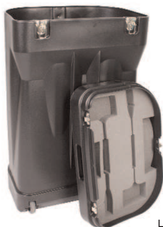
Lid with internal foam insert for lighting storage