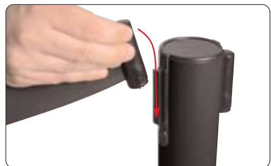
Simply slide the webbing into the fixing and lock into place.