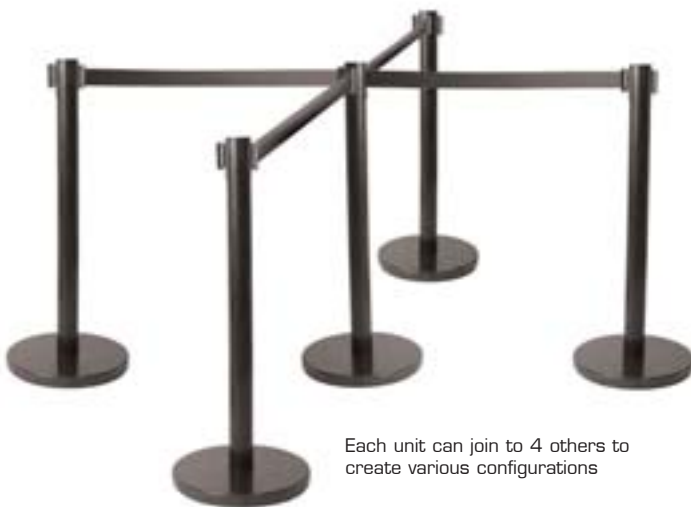
Each unit can join to 4 others to create various configurations