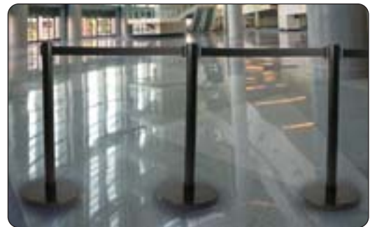
Example of 3 units joined together to form a row