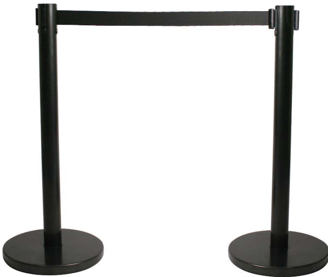
NB: Image shows 2 connected units (supplied as single units)

Leader plus is a smart retractable barrier system, ideal for use in retail outlets, airports, entertainment venues, reception areas or any location where queue control is required.