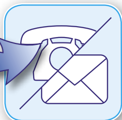
Step 5 Contact us