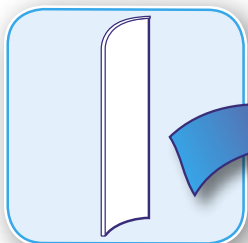
Step 1 Shape

On the next pages you will find a guide to ordering your flag, this should help you decide exactly what you require before you call us. If you have any questions or are ready to order please call us on: 01280 707 180