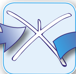
Step 3 Base