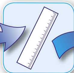
Step 2 Size