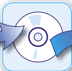
Step 4 Artwork